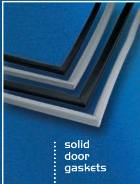
solid door gaskets

Custom made doors available for any ice merchandiser. Call for a quote.