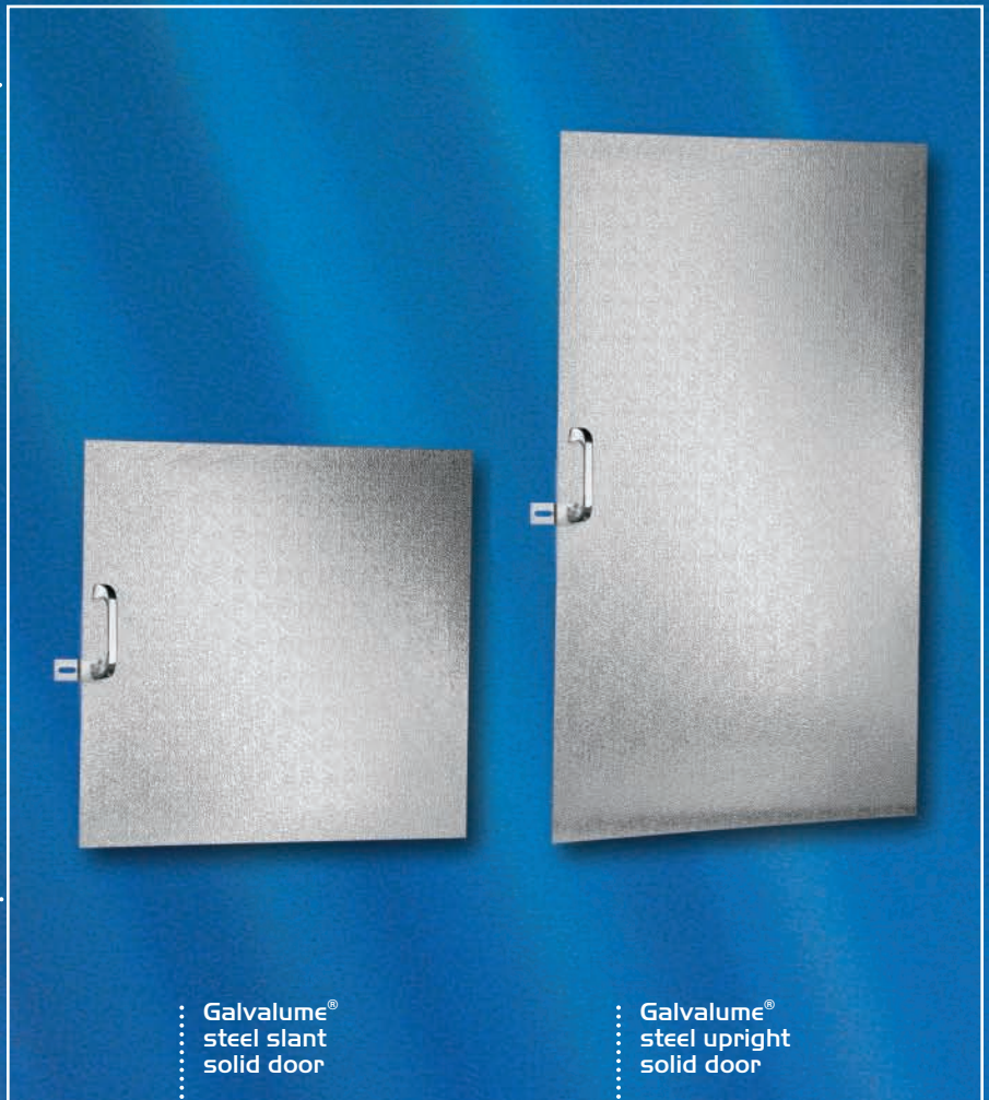
Galvalume® steel slant solid door