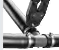
with Standard Jaw