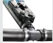
with Side Jaw